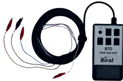
BTD Field Test Unit

The BTD-350 Field Test Unit is a simple battery powered device which simulates lightning in several range bands. It can be used as part of commissioning tests or during routine maintenance activities to enhance user confidence.